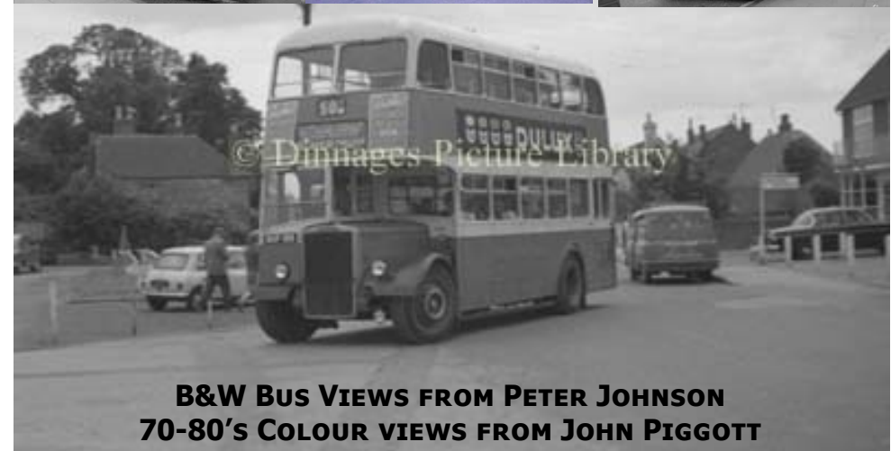
B&W BUS VIEWS FROM PETER JOHNSON 70-80'S COLOUR VIEWS FROM JOHN PIGGOTT